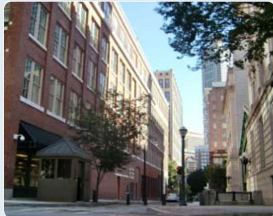
Federal Office Building for GSA, Atlanta. Brookwood provided full Program Management services (referred to as “CM-as-Agent” by GSA) for this complex expansion of court administrative offices and facilities which included historic restoration and up-grade to Federal blast resistant exterior walls of this late 19th Century brick and timber structure, all new interior, and a tunnel beneath the dividing street for secure access.

➤ Expertise required: Contracts management and organization of documents, and the selected method(s) of filing.