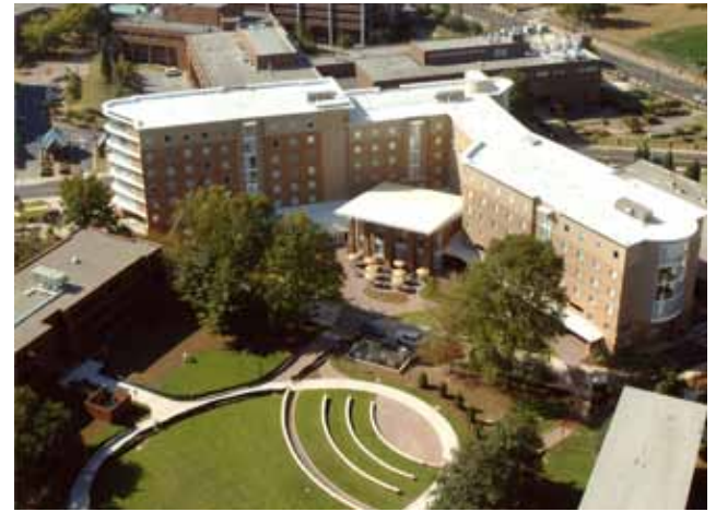
Spelman College, 300 beds in suites and apartments, a Dining Hall, six apartments for visiting Faculty and Trustees, 100-car parking garage on basement level. Brookwood Group first provided an update to the Campus Master Plan, Strategic Advisory services on approach to procurement and then provided full Program Management services. Project delivery method: Bridging.