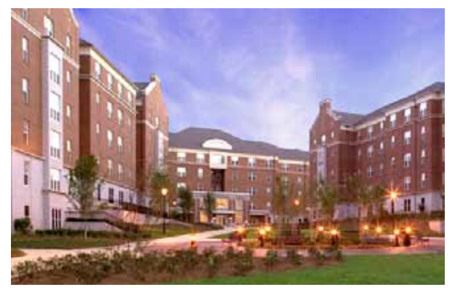
University of Georgia, East Campus Housing, consisting of 1200 beds in single occupancy suites. Brookwood provided development of master plan for the immediate project area and preparation of the Request for Proposal from developers. Project Delivery Method: Private Developer on University Land.