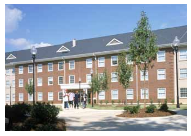
Morehouse College Student Housing, 375 beds of single occupancy bedrooms in suites with in-suite baths along with meeting, office and laundry facilities. Brookwood first carried out an up-date of the Morehouse Campus Master Plan then helped Morehouse arrange for non-profit bond financing, provided the design services as the Owner's Design Consultant under Bridging procedures, and provided full Program Management Services. Project Delivery Method: Bridging