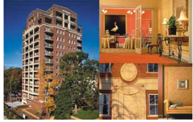
The Wakefield, high end Multi-Family High-Rise Apartment Building in the Buckhead area of Atlanta. Executives of Brookwood Group were the Developers. Brookwood provided the following services: Design (Owner's Design Consultant) under Bridging procedures and full Development Management including site selection and procurement, marketing, construction management, and arranging financing. Project Delivery Method: Bridging.