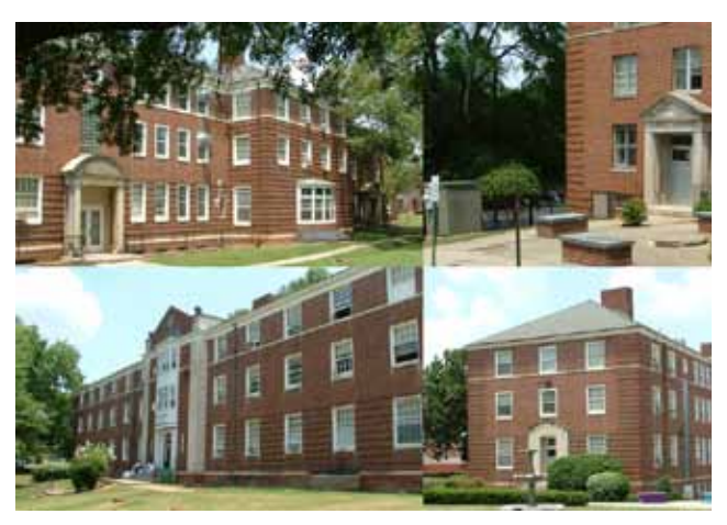
Clark Atlanta University Student Housing, restoration and modernization of three 1940s-era dorms. Brookwood provided full Program Management Services. Project Delivery Method: Modified Bridging Design-Build.