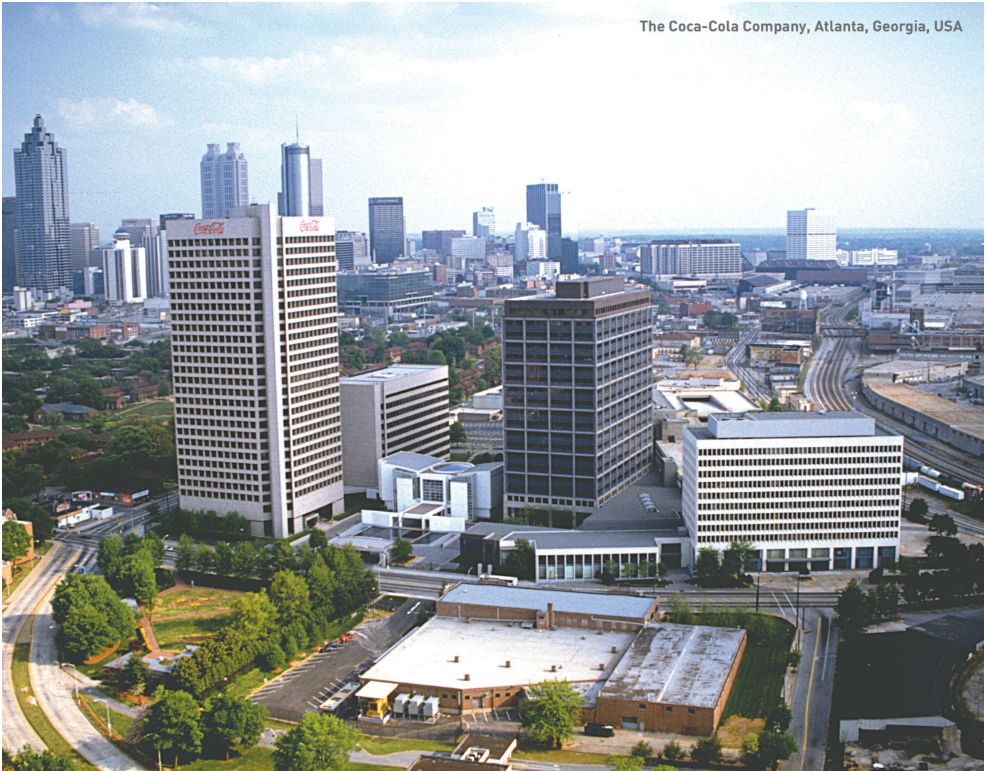
The Coca-Cola Company, Atlanta, Georgia, USA