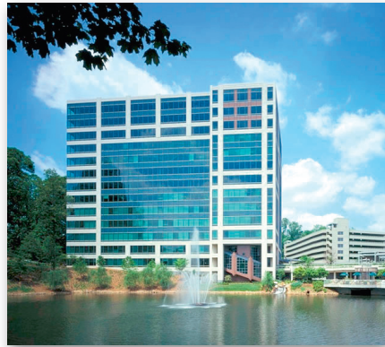
From left to right: Salesforce.com proposed Mission Bay campus, San Francisco, California, USA; Turner Broadcasting Entertainment Channels Campus, Atlanta, Georgia, USA; Porsche U.S. Headquarters, Atlanta, Georgia, USA.