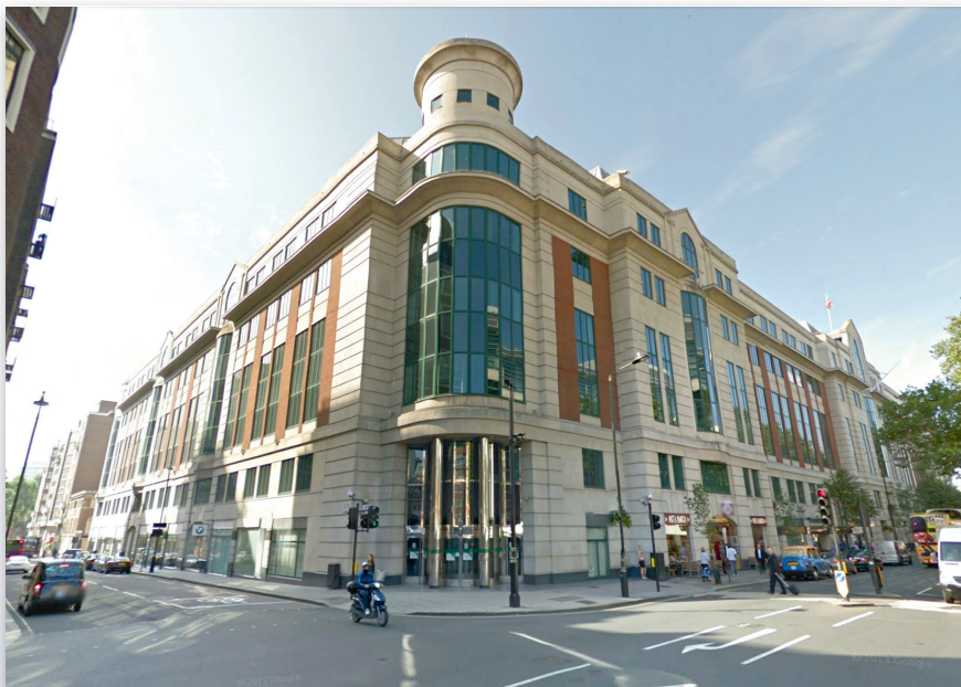
Great Minster House, London. Refurbishment of this 127,000SF for the Department for Transport/Amey Group.

clients, stakeholders, designers, consultants and construction teams.